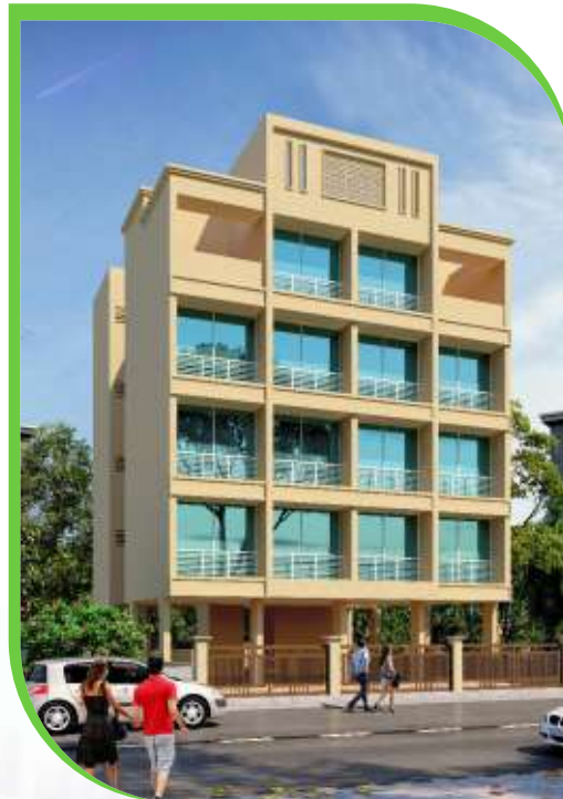
DEEP RESIDENCE - 2

Area : 240 Sq. Mtr No Of Floors : G + 4 Project Status : Completed Location : Karanjade, Panvel Flat Constructed : 20 Units